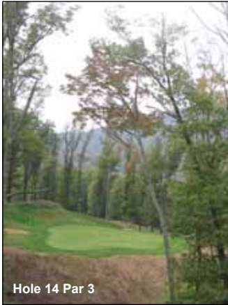
Hole 14 Par 3

M.I.A.'s, and it's time to reload! The par 5 fifteenth is an aesthetic treasure with its unique design and countryside backdrop. Two deep bunkers square in the center of the fairway make a terrific risk-reward hole that gets better every time I play it. The par 4 sixteenth has the only real blind tee shot on the course. Par here is a good score. The final par 5, the seventeenth, requires well positioned shots for optimum success. Avoid anything left, which is jail. The closing par 4 plays uphill, so take an extra club on your approach to the green.