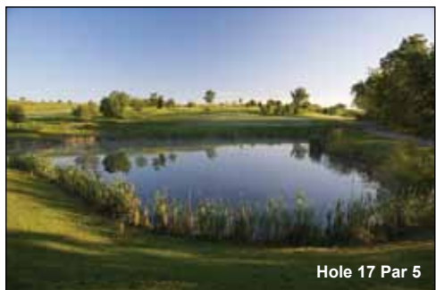
Hole 17 Par 5