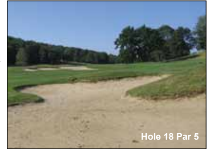
Hole 18 Par 5

the first par 5, number three. One of the unique traits of Cacapon occurs on both par 3s on the outward nine. Holes four and eight share a double green that is nearly 100 yards long. Both play downhill to one of the property’s lowest areas. All par 4 doglegs, holes five through seven feature the toughest rated hole on the course, seven. At 430-yards from the blue tees, a big drive down the right side clears the corner. The par 5 ninth requires two straight shots to set up a wedge to the dance floor for a putt at birdie.