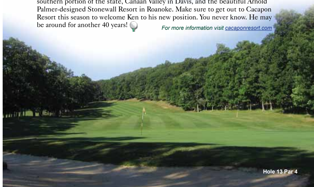
Hole 13 Par 4

For more information visit cacaponresort.com