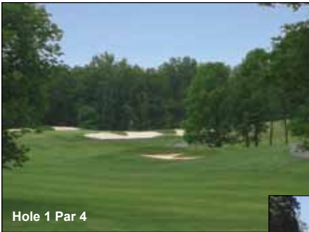
Hole 1 Par 4