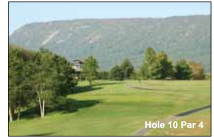
Hole 10 Par 4

the cover). The approach on this roller-coaster hole climbs slightly uphill so take an additional club. You will remember the virtually unobstructed tee box on the par 4 sixth that presents a panoramic marvel of the surroundings. The front nine wraps up with two par 4s that are some of the toughest driving holes on the course.