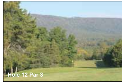
Hole 12 Par 3