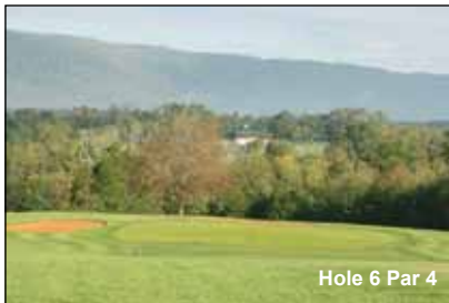
Hole 6 Par 4