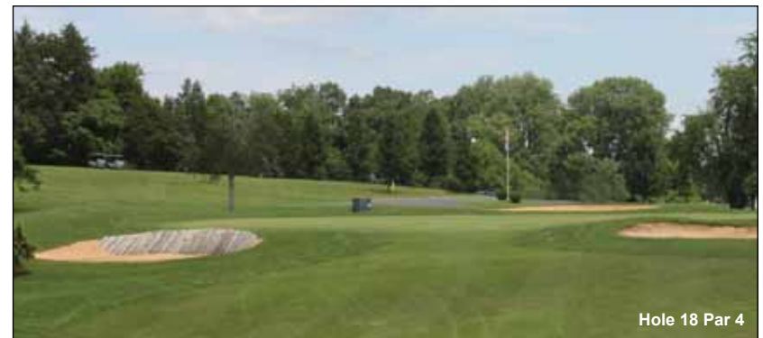
Hole 18 Par 4

The town of Luray’s other main attraction has always been the caverns with nearly one-half million visitors annually. The underground marvels of Luray Caverns make it one of the great wonders of the world. I still to this day remember my first visit there on a school field trip in the 1960s. The caverns are perhaps best known for the Great Stalacpipe Organ, a lithophone made from solenoid-fired strikers that tap stalactites of various sizes to produce tones similar to those of xylophones, tuning forks, or bells. Shenandoah National Park is headquartered in Luray, the nearest town to the Thornton Gap entrance to Skyline Drive (to the east).