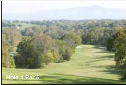
Hole 1 Par 5

How many times have you walked up to the first tee on a golf course and told your playing partner to watch out for the hole in the middle of the fairway? My guess would be only once, and that time and that place would be when you played Caverns Country Club. I have more to tell you about this rare oddity and other reasons to play this wonderful golf course located in the Shenandoah Valley of Virginia. Many call this area