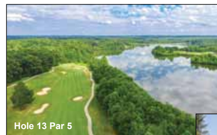
Hole 13 Par 5

I've always thought the inward nine at The Gauntlet offers a little more breathing room, especially holes eleven through fifteen, which gives you the chance to get back a couple of those shots lost on the front. The straight, short par 5 tenth plays longer than advertised. It offers a