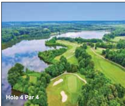
Hole 4 Par 4